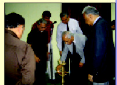
Inauguration of workshop of Genital Reconstruction