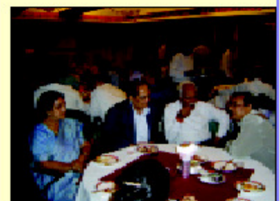
Social evening of last year foundation day