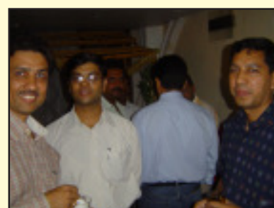
Social evening of 10 th Oct – 05