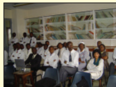
Faculty and residents at Nairobi