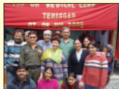
Health checkup camp, Leh