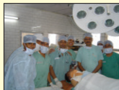
Operating team at Leh