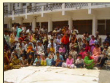
Well baby cleft camp operated cases