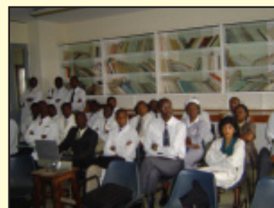
Faculty and residents at Nairobi