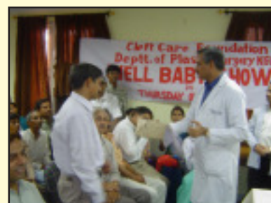
Thanks for helping the dept in Cleft work