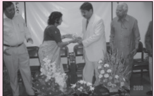
Inaugural function of the 32 nd annual function