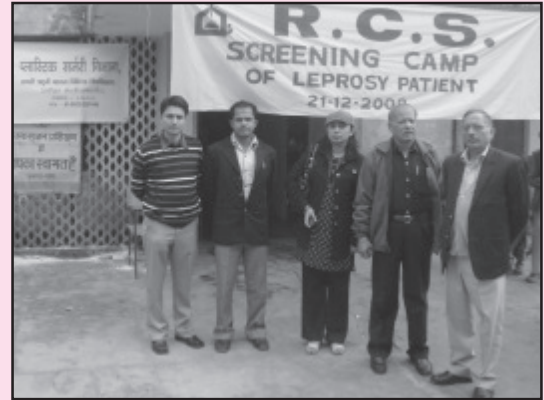
Leprosy screening camp at Lakhimpur

All the staff nurses and class IV employees of the O.T. and ward, underwent training of safe injection practices.