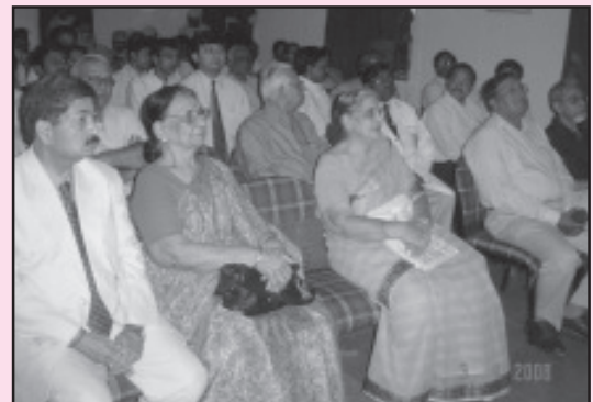
The dignitaries listening to the annual report