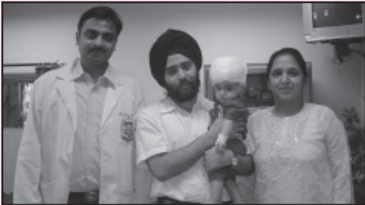
Neurosurgeon and his Gynaecologist wife from Jullunder for Tt of their son for Craniofacial deformity