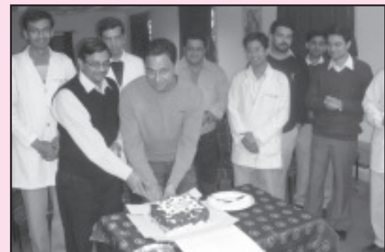
Cutting the Christmas cake