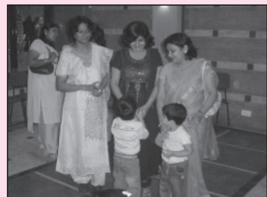
Family get together