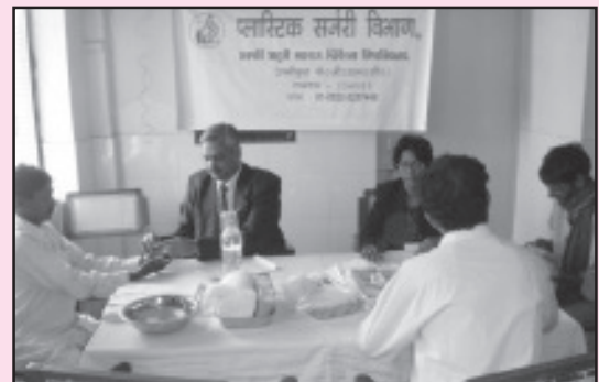
Screening of Leprosy pts for RCS at CMO office Kanpur