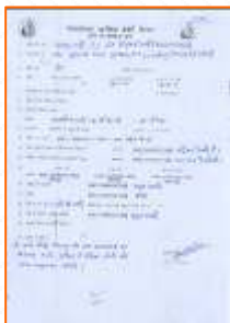
Feedback form- suggestion for improving our private wards