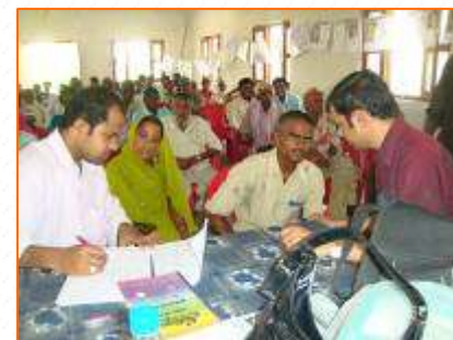
Screening camp for leprosy surgery at Hardoi