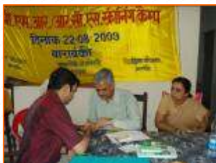
Surgery camp with the help of district administration at Barabanki

(Bihar) & Udaipur. Screening camps for leprosy patients were organized in Kanpur, Barabanki and Hardoi, 113 patients were operated in the department. The department of Physical Medicine and rehabilitation is actively helping in hosting and housing these patients.