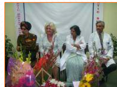
Inauguration of 33rd Annual Foundation Day Function