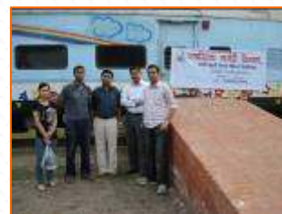
Our collaboration with Life line express

(Bihar) & Udaipur. Screening camps for leprosy patients were organized in Kanpur, Barabanki and Hardoi, 113 patients were operated in the department. The department of Physical Medicine and rehabilitation is actively helping in hosting and housing these patients.