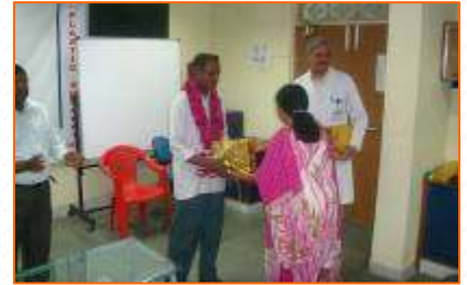
Mr.Jio: gratitude for a well done service to the department.