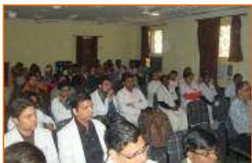
Employees listening to suggestions to improve client (patients) satisfaction.